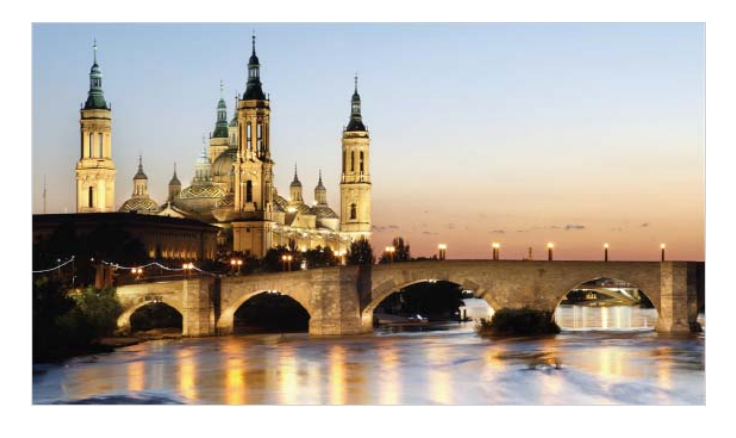
Pilar Basilic and Ebro river

The readings will draw from peer-reviewed articles in the operations and industrial ecology literature, as well as managerial articles from outlets such as California Management Review and Harvard Business Review.