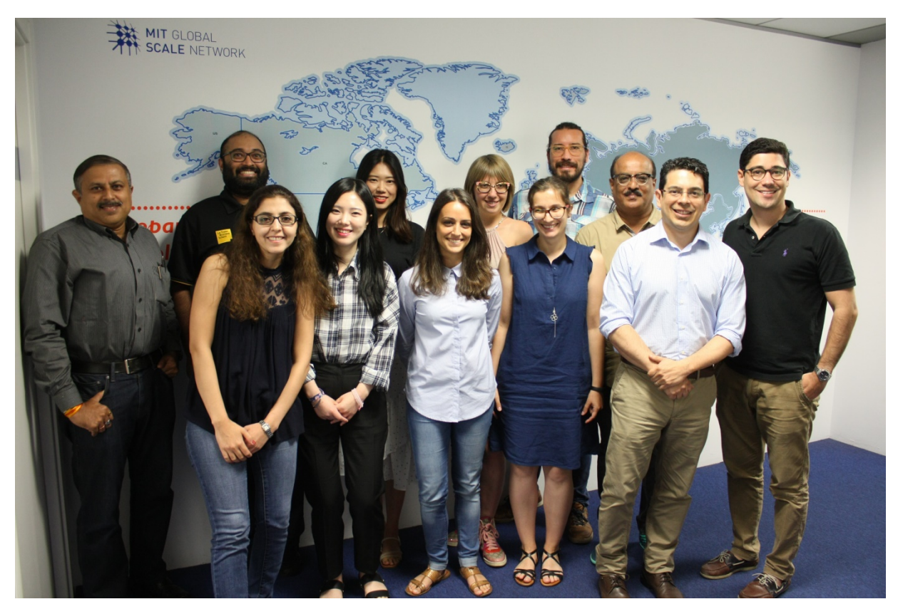
PhD Summer Academy 2018

"The PhD summer academy at ZLC was an excellent avenue to develop myself as an academic within the supply chain sector. An intensive course conducted by academics who are leaders in their respective fields in SCM is ideal for any budding academic. Not only in broadening SCM knowledge, but also in learning emerging trends in SCM and publishing in top-tiered SCM journals. Moreover, learning alongside PhD students and early career academics from different countries exploring different niche areas in SCM broadened my horizons as a young academic. I strongly recommend any doctoral candidate in SCM to invest two weeks of their time here - they will not regret it."